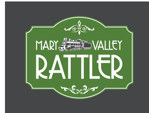
Primary Logo Green