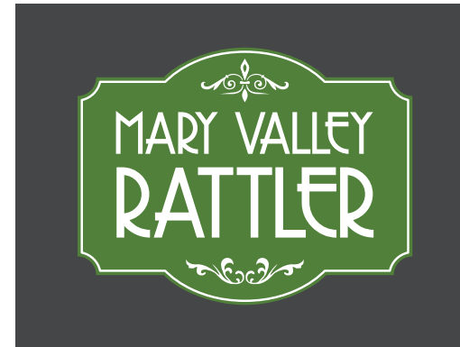
Corporate Logo Green