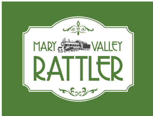
Primary Logo White

The primary logo should be used as the first option, it can be used in reverse when required which allows flexibility for printing on various background colours.