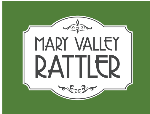
Corporate Logo Charcoal