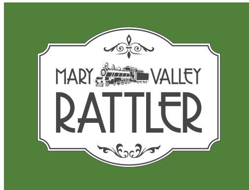
Primary Logo Charcoal