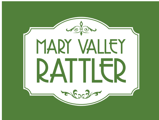
Corporate Logo White

The corporate logo is designed for use when a cleaner aesthetic is required. It can also be used when the train illustration is a prominent part of a design or on merchandise. This logo can also be reversed for flexibility.